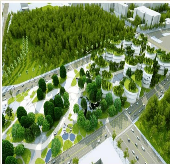
Fig 5: Eco-Park as a New Model in Park-Design

The parks are public green areas. The areas generally have abundance of trees and plants, grass and various facilities (such as benches, playgrounds, fountains and other equipment) that allow enjoying the Leisure and rest. Ecological, for its part, is an adjective that refers to what is linked to the ecology. This latter term (ecology), in its broadest sense, mentions the interactions that maintain living beings to the environment.