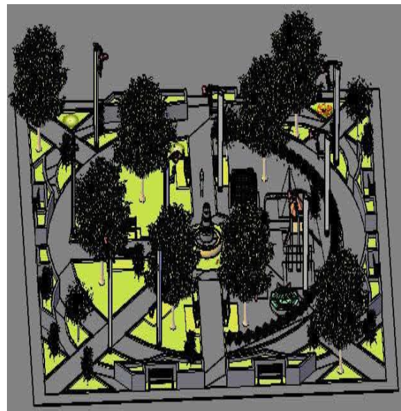
Fig 4: A Sketch of a Typical Recreation Facility

(7) The Open Space system(1965 onwards): The mid 1960 saw major shift in park design. Recreation came to be seen as something could take place anywhere-in the street, on a rooftop, a water front, along an abandoned railway line or in a traditional plaza. In defiance of previous notion government standardization, a more artistic, participation sensibility emerged.