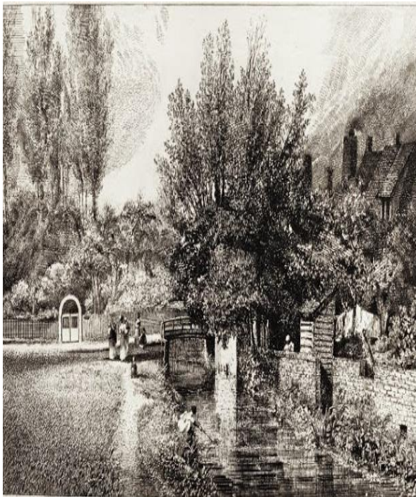
Fig 3: A Sketch of a Typical Reform Park