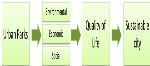
Fig 1: Urban Parks and City Sustainability